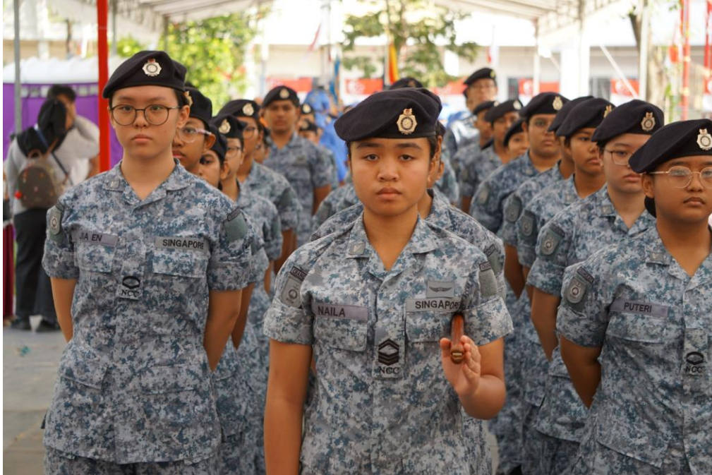
NCC Air Girls