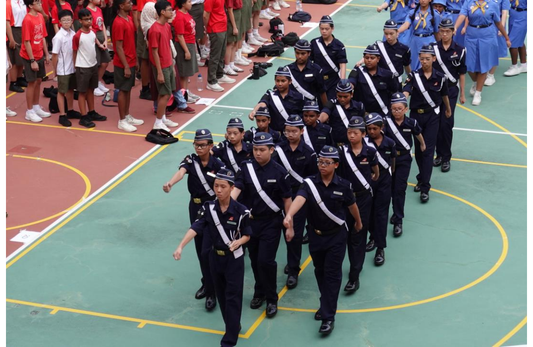
The Boys' Brigade