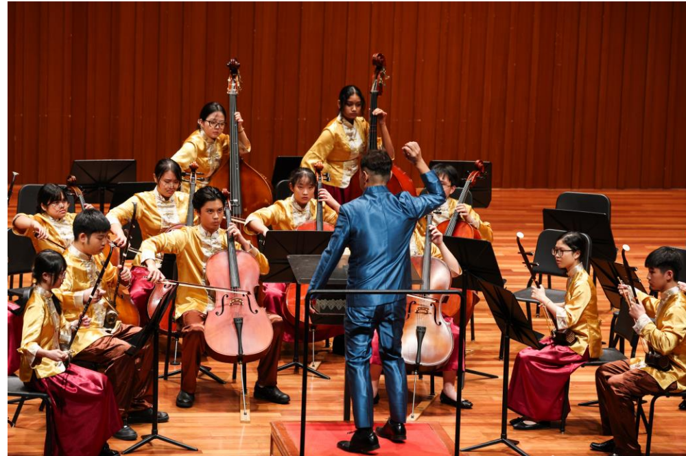
Chinese String Ensemble