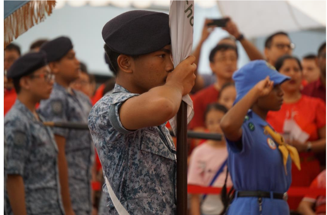
NCC Air Boys